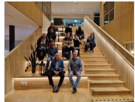
BBS Soltau delegation at Teknikum in Sweden

On the 2 nd of December, the students presented their progress and results of the first building block so far, and this was linked via live video feed to each of the participating colleges. They explained their choices of global goals to be printed and the personal relevance and importance. The results of what our students had produced impressed everyone tremendously!