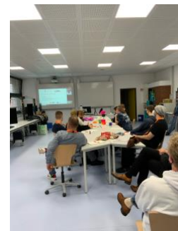
The first teacher training session

On the 2 nd of December, the students presented their progress and results of the first building block so far, and this was linked via live video feed to each of the participating colleges. They explained their choices of global goals to be printed and the personal relevance and importance. The results of what our students had produced impressed everyone tremendously!