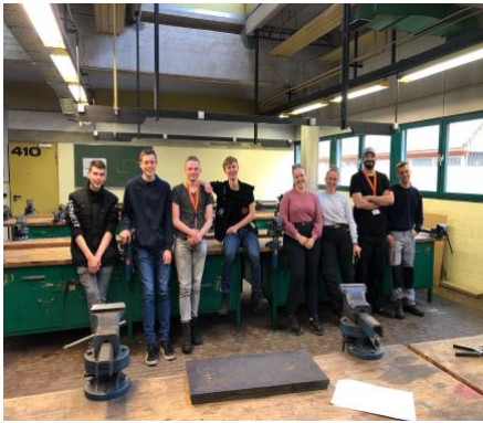
The students from Nova College in BBS Soltau

Unfortunately, the Covid 19 pandemic yet again managed to throw a slight spanner in the works. Just as the Swedish contingent was meant to start their part of the carousel ride to the Netherlands, the pandemic put a stop to it. However, the visit of Sweden to the Netherlands was successfully completed during the second week of March and the Swedish delegation was able to visit Nova College for the second round of Carousel rides. Both students and teachers were extremely enthused and impressed by their visits to each school and thoroughly enjoyed this unique experience.